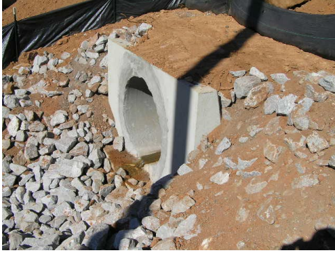
EXHIBIT 5 – SPECIAL PROVISIONS AND CONTRACT REQUIREMENTS

Use Pipe Straight Headwall (719-605-00) when specified in the plans or special provisions. Use straight headwall only in locations where pipe exposed end does not face the direction of traffic.