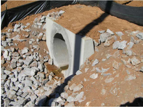
EXHIBIT 5 – SPECIAL PROVISIONS AND CONTRACT REQUIREMENTS

Use Pipe Straight Headwall (719-605-00) when specified in the plans or special provisions. Use straight headwall only in locations where pipe exposed end does not face the direction of traffic.