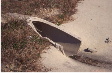
EXHIBIT 5 – SPECIAL PROVISIONS AND CONTRACT REQUIREMENTS

Use Beveling of Pipe End (719-610-00) when specified in the plans or special provisions. Beveled ends may only be used on flexible pipe up to 24" diameter and on rigid pipe up to 60" diameter. When beveling of pipe ends is specified on flexible pipe larger than 24" diameter, install pipe straight headwall, pipe end structure, flared end section, or wingwall section. Use factory fabricated beveled ends for all pipe types unless approved by the Engineer.