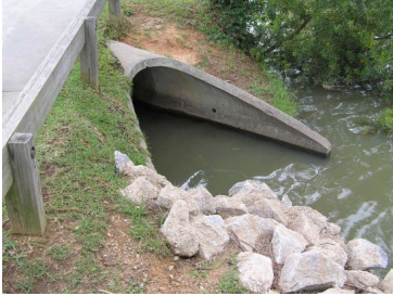
Use Pipe Flared End Section when specified in the plans or special provisions.