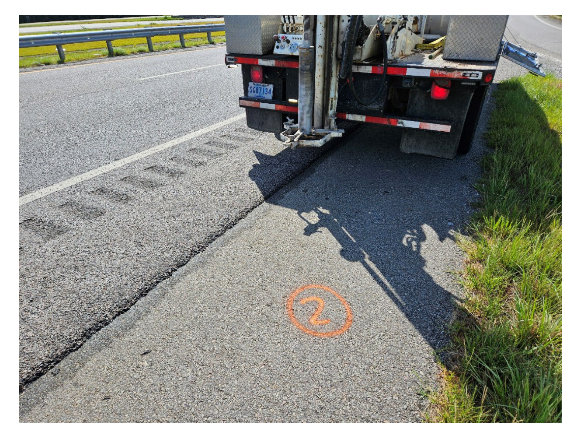
Core 2 Location B