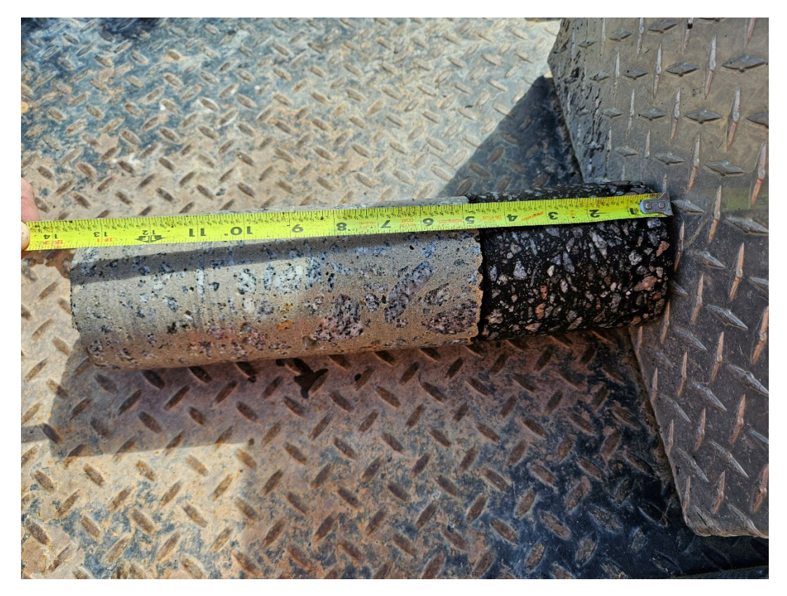
Core 1 Picture