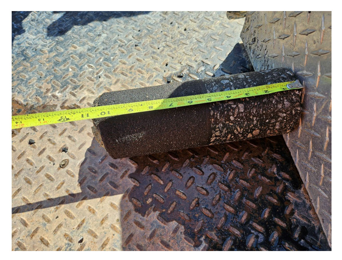
Core 2 Picture