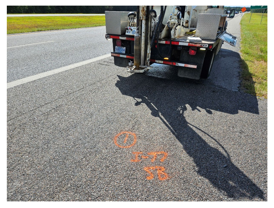
Core 1 Location A