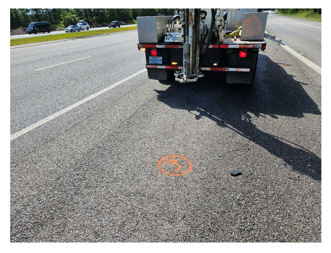
Core 3 Location C