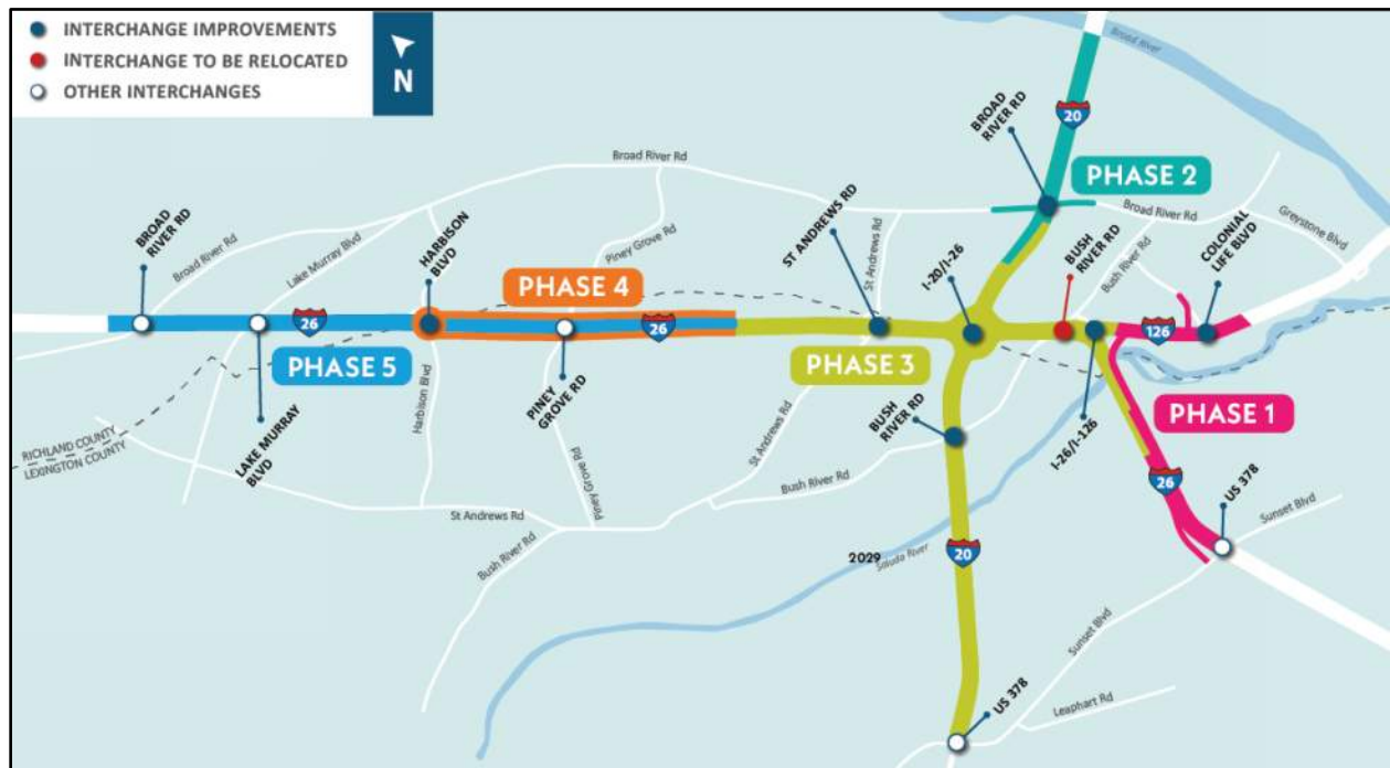
Figure 100-1: Carolina Crossroads Program Phasing Map