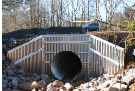
Use Pipe Wingwall Section when specified in the plans or special provisions.

Completely seal interface between pipe and end treatment with grout. If bricks or shims are used to place pipe, take care to remove all air pockets and voids when grouting.