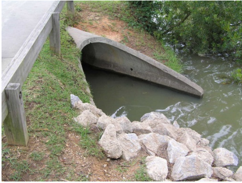
Use Pipe Flared End Section when specified in the plans or special provisions.