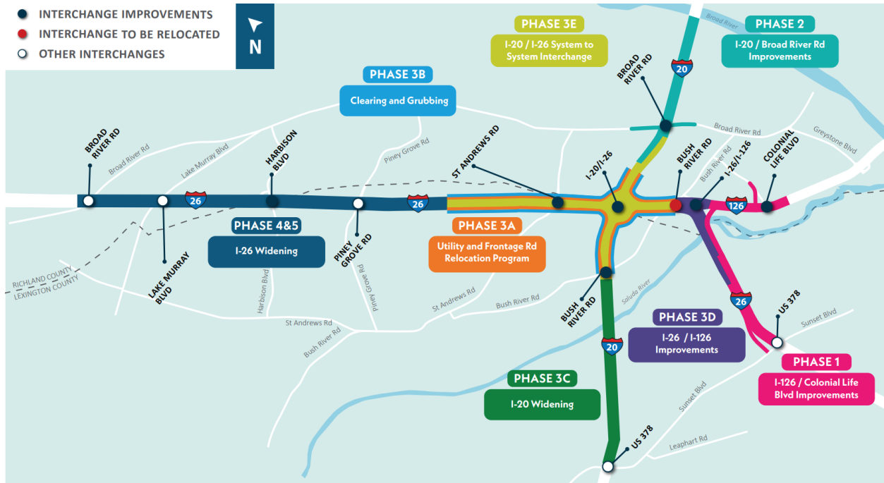
Figure 100-1: Carolina Crossroads Program Phasing Map