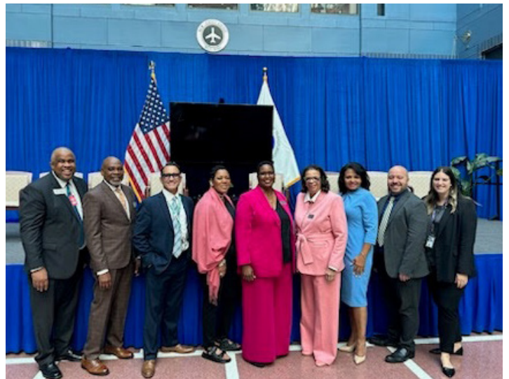
KRJC team with USDOT OSDBU staff.