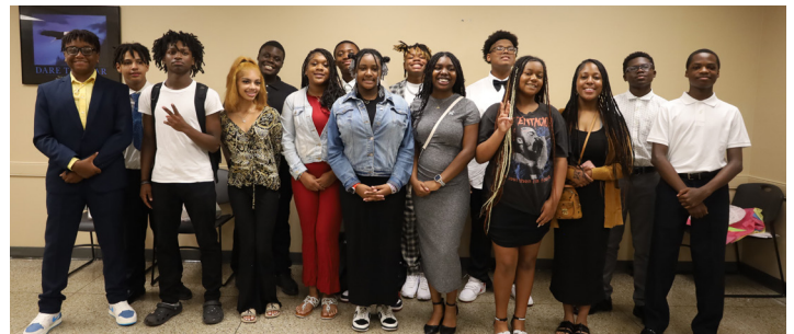
The graduating class feel prepared to explore careers in transportation and STEM related fields.