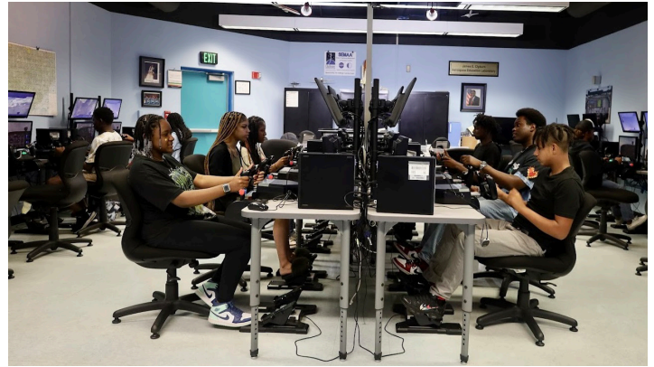
Students at the Challenger Learning Center of RCS D1 learn about air transportation via flight simulators.

attended field studies at the Challenger Learning Center, the South Carolina Department of Transportation Traffic Management Center, Boeing of South Carolina, Clemson University, Charleston Port Authority, BMW, Honda, and Charleston Railroad Museum. The enhancement component consisted of ACT preparation.