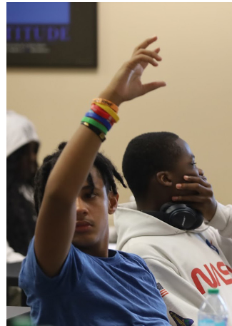
Engaged students listen and ask questions during the comprehensive and engaging lessons of the ACT/SAT Prep Course designed to help students excel in standardized tests.

STI continues to serve as a mechanism that prepares our future workforce for rewarding careers in the transportation industry.