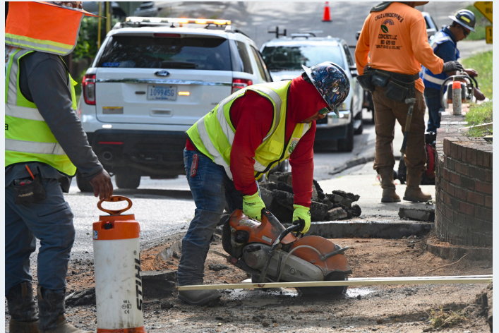
Cruz Landscaping and Concrete, LLC stepped up for additional work when the prime for the Lorick Avenue project said they also needed Flaggers. Cruz employees had recently completed Flagger's Novice Training offered by the division's Business Development Center held onsite at the Southeastern National Safety Council in Irmo, SC.