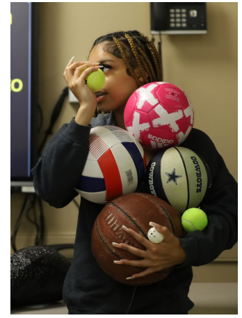
Student considers how to solve an engineering problem when attempting to move objects from Point A to Point B as part of a presentation about careers in transportation.