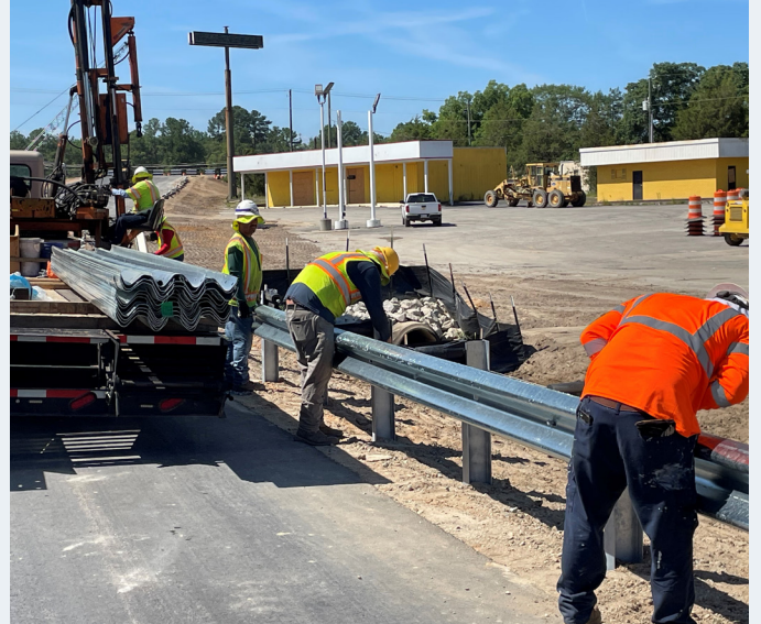
Crew from Reynolds Fence and Guardrail install new guardrail at I-26 approaching the St. Matthews exit, 119.