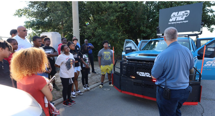
Students visited SCDOT's Traffic Management Center for a presentation focused on emergency response procedures and how its State Highway Emergency Program (SHEP) assists motorists whose vehicles are experiencing mechanical problems and provide support and assistance to emergency response teams during incidents.

STI is comprised of three components: academic, enhancement, and sports/recreation. Each component provides a stimulating introduction to the field of transportation, motivates students towards professions in the industry, as well as enhances leadership and teamwork skills. The academic curriculum emphasizes the importance of safety and provides exposure to all modes of transportation including land, air, water, and rail. During the program, students engaged in activities that assisted in gaining unique exposure to the transportation industry. Transportation professionals provided presentations about transportation career options, highway construction projects and safety. Students