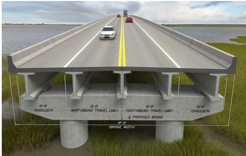
Figure 3. Typical section of proposed bridge

bridge would contain navigational lights in accordance with 33 CFR § 118 and as approved by the USCG.