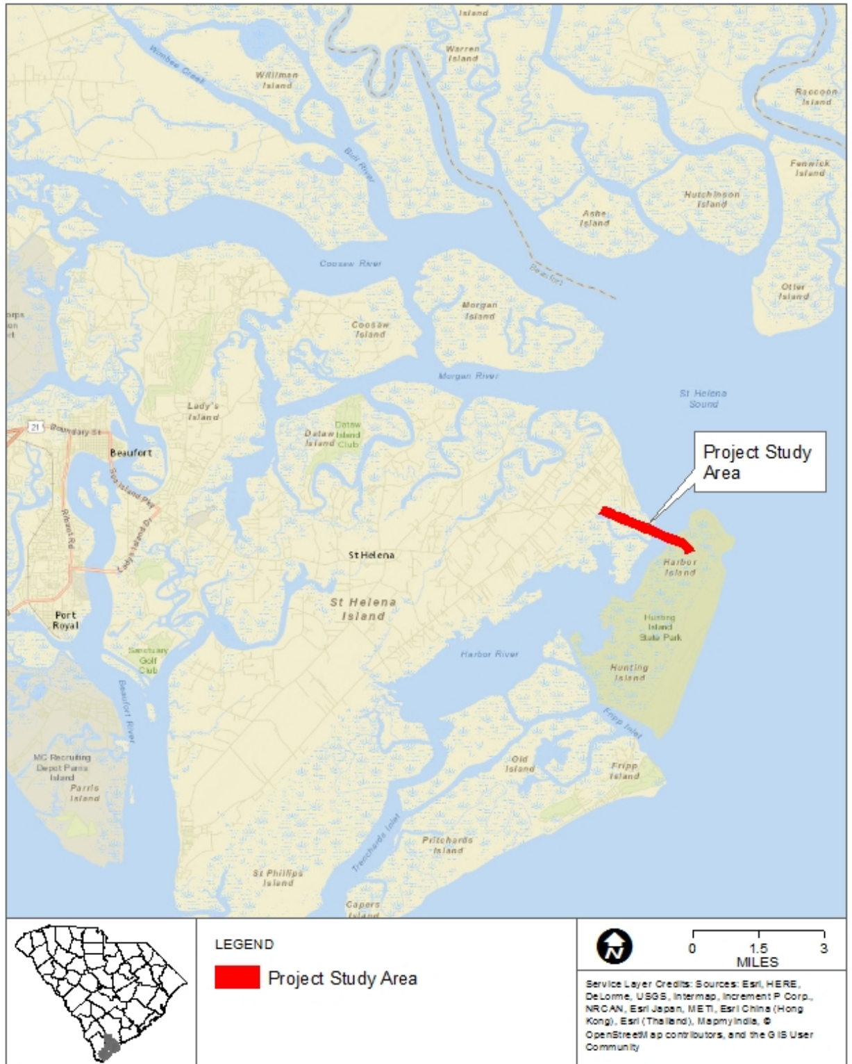
Figure 1. Project Location Map