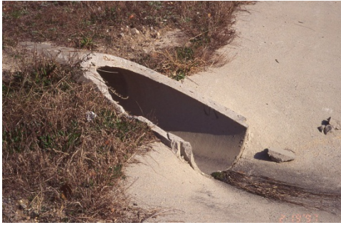
EXHIBIT 5 – SPECIAL PROVISIONS AND CONTRACT REQUIREMENTS

Use Beveling of Pipe End (719-610-00) when specified in the plans or special provisions. Beveled ends may only be used on flexible pipe up to 24" diameter and on rigid pipe up to 60" diameter. When beveling of pipe ends is specified on flexible pipe larger than 24" diameter, install pipe straight headwall, pipe end structure, flared end section, or wingwall section. Use factory fabricated beveled ends for all pipe types unless approved by the Engineer.