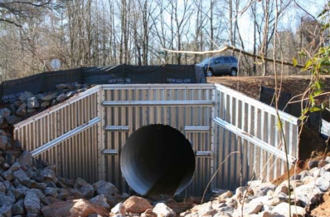
Use Pipe Wingwall