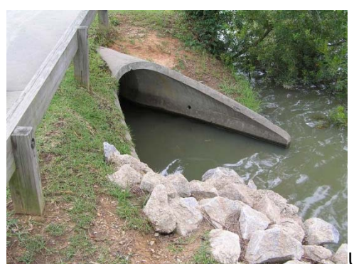
Use Pipe Flared End Section when specified in the