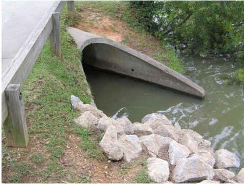
Use Pipe Flared End Section when specified in the plans or special provisions.