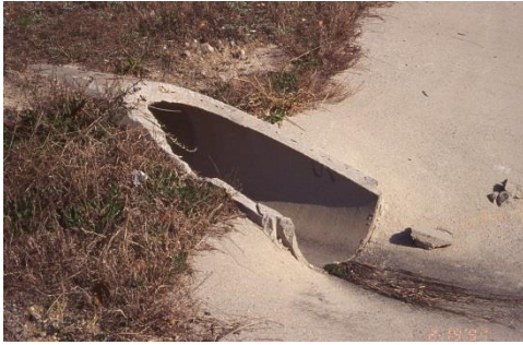
EXHIBIT 5 – SPECIAL PROVISIONS AND CONTRACT REQUIREMENTS

Use Beveling of Pipe End (719-610-00) when specified in the plans or special provisions. Beveled ends may only be used on flexible pipe up to 24" diameter and on rigid pipe up to 60" diameter. When beveling of pipe ends is specified on flexible pipe larger than 24" diameter, install pipe straight headwall, pipe end structure, flared end section, or wingwall section. Use factory fabricated beveled ends for all pipe types unless approved by the Engineer.